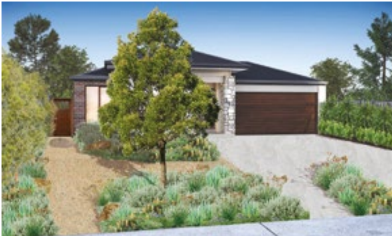
Artist impression only.

A range of evergreen plants that colour and flower all year round and bring seasonal foliage, while symmetrical plantings reflect a more formal garden style.