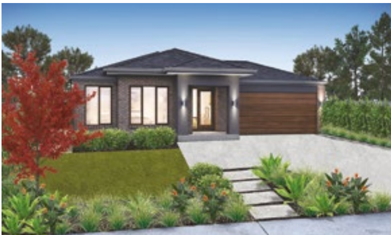
Artist impression only.

Native plants and trees provide an evergreen frame for your new home while flowering plants add a splash of seasonal colour to your front yard.