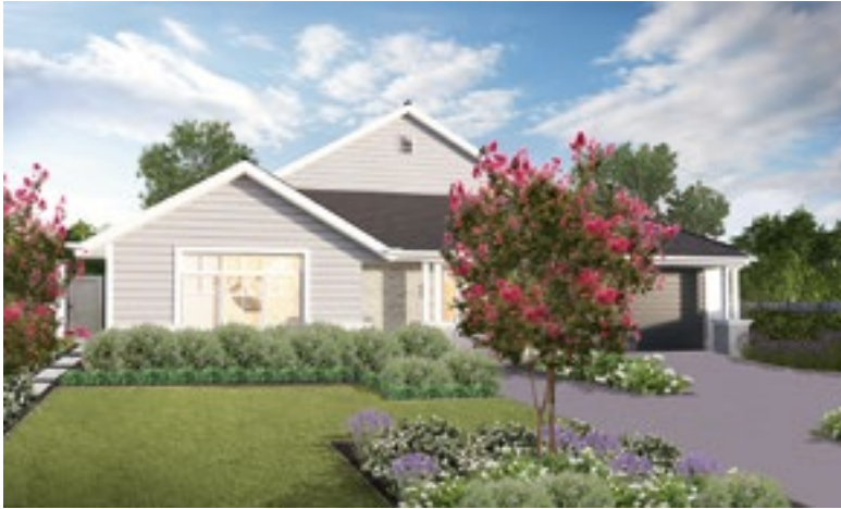
Artist impression only.

There are three contemporary garden designs for you to choose from. Each has been created with the goal of enhancing both your home and the surrounding environment.