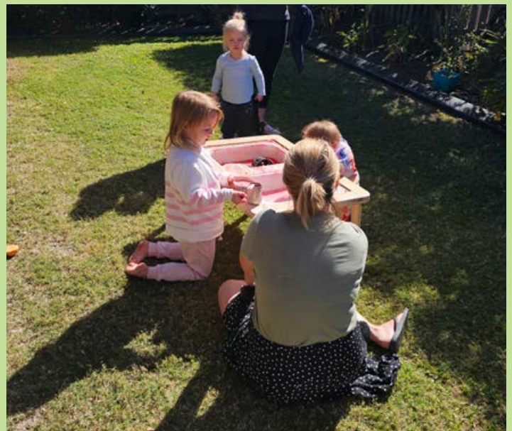
Kids enjoying play time, making new friends