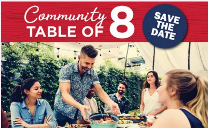
Meet your new neighbours in Flagstone

The Flagstone Community Association is committed to making living here in Flagstone a great experience and has established a Meet & Mingle to ensure new locals don't feel isolated in any way as they don't know anyone in Flagstone. They can come down every Friday from 5.30pm till 8pm and there will always be a friendly face to have a drink or dinner with and a good chat. So, no matter if you're single, married, a couple or family with children... all are welcome!