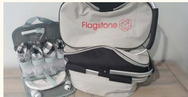
Flagstone Hamper Gift