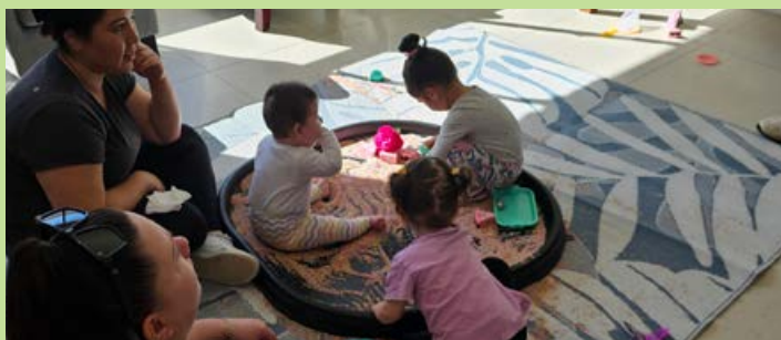
Mum's and bubs in Flagstone enjoying messy play