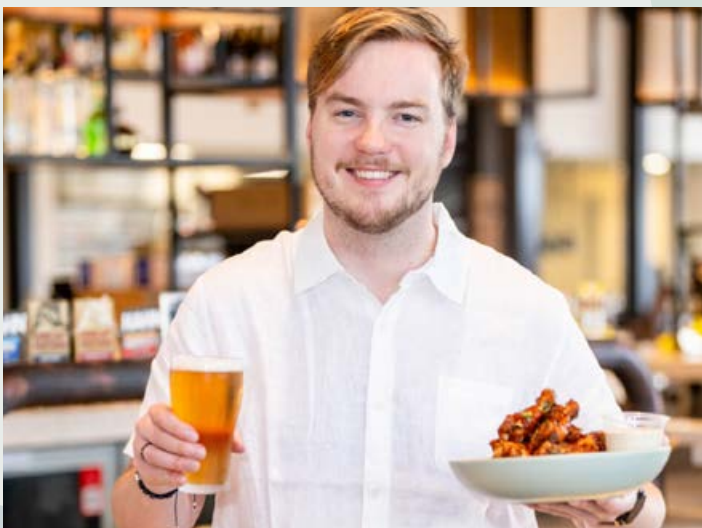
Flagstone staff member serving Flagstonians with a smile