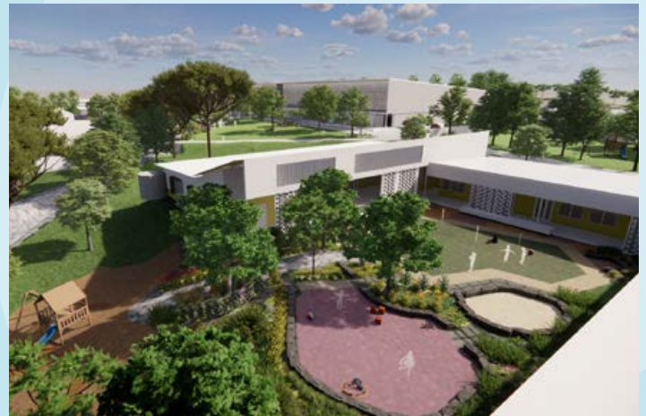
Artist impression of St Bonaventure's College, coming to Flagstone in 2026

Drawing on characteristics of the Franciscan Tradition, St Bonaventure's College will provide high-quality,