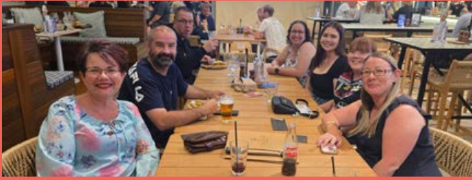
Flagstone locals catching up at Flagstone Tavern