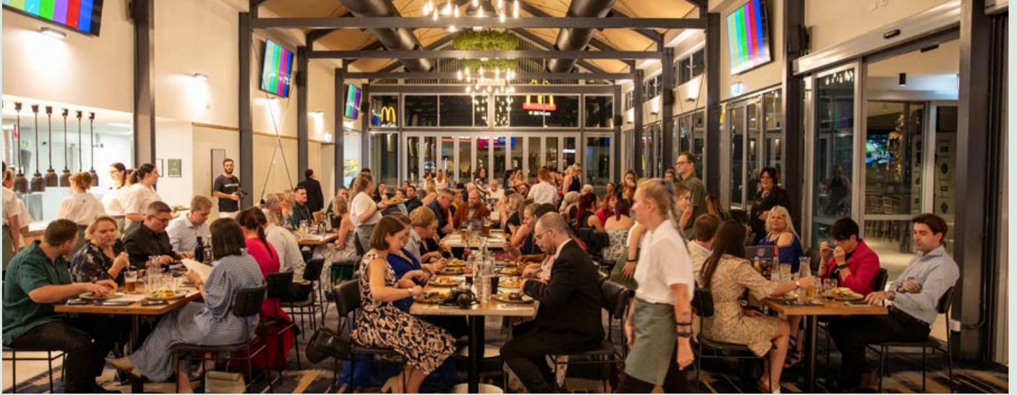
Awards Dinner at the Flagstone Tavern

Put your hands together for the winners of our first ever Flagstone Favourites Local Business Awards!