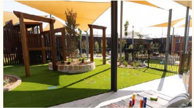
PEAK Outdoor Area

It's the perfect day out for the whole family to explore the amazing centre and meet their passionate team.