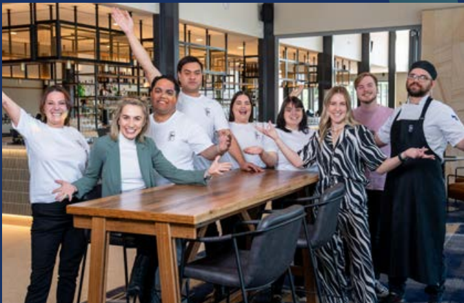
The new Flagstone Tavern Crew

Flagstone Tavern has opened to glowing reviews and is fast becoming a centrepiece of our vibrant community.