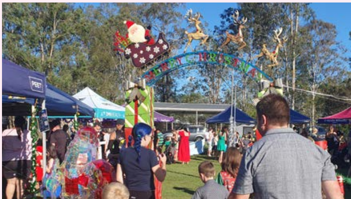
Flagstone Community Christmas Elf Trail entry

Come and enjoy the fun, and see what makes Peak a special place for little learners!