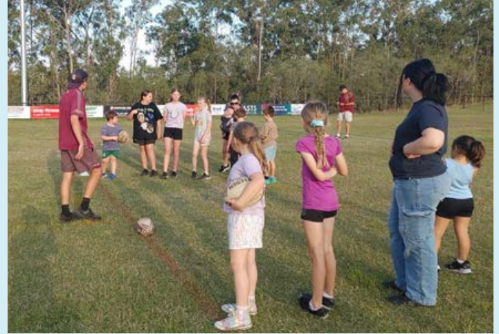
Come and try session for new players

If you are interested in yourself or a family member playing in either a Junior or Senior Division in the 2024 Season (2 Oct - 13 Dec) please email flagstonetouch@gmail.com for further details