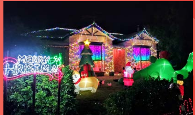
Christmas Lights in Flagstone

Gather your nearest and dearest, pack a picnic blanket and spend a beautiful evening out this Christmas.